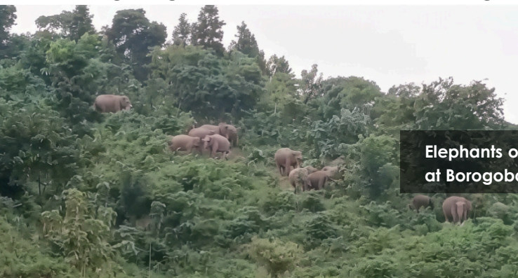
Elephants observed in the 2024 ANR plantation spanning 5.77 hectares at Borogobal VPIC, Tikrikilla Block, West Garo Hills

On 9th September 2025, 30 members of Self-Help Groups in Umsning Block, Ri Bhoi participated in hands-on oyster mushroom training at Umtasor Nongjymie, led by expert Aiban Nongrum. Participants learned every step from preparation to disease management, gaining practical skills to start cultivation in their communities, with many describing the experience as "a true blessing."