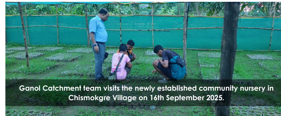
Ganol Catchment team visits the newly established community nursery in Chismokgre Village on 16th September 2025.

On 8th September 2025, training was conducted for Executive Committee members from five villages at Kyrdemkhla, Umiew Catchments.